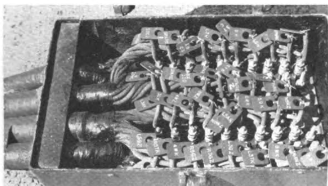
CABLE AT END OF VIADUCT is terminated in junction box, and run underground to switches signals and instrument house