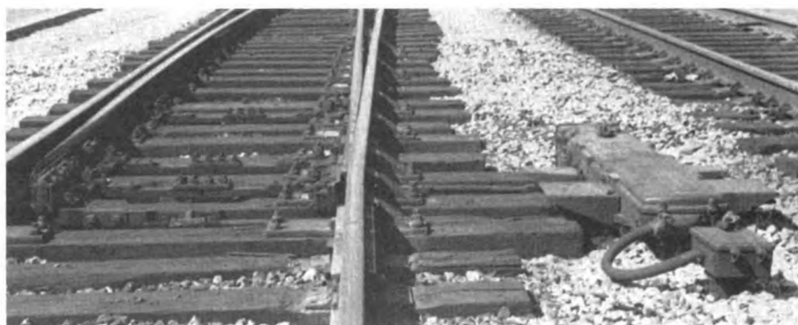
TIES are dapped for switch machines. Turnouts are No. 12 with 22 ft points

The switches are equipped with roller bearings and are operated by Model 5C, 110-volt d.c. switch machines. The machines have self-contained master controllers and outboard shoe-type brakes. All switches are equipped with swivel-type front rods. The switch machines are mounted on dapped No. 1 and No. 2 ties, which obviates the necessity of providing offsets in the throw rod, lock rod and point detector rod.