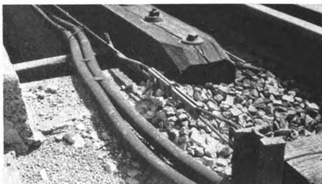
SIGNAL CABLE from control machine at depot runs aerially alongside viaduct to field locations

by white lines \frac{1}{4} in. wide. Below the track diagram are three-position signal levers, which normally stand in the center (vertical) position to control the signals to Stop. To clear a signal for traffic movement to the right the signal lever is turned 90 deg. to the right, and to clear the signal for traffic to the left, the signal lever is turned 90 deg. to the left. Green lights located in the center of the signal levers light when signals have been cleared. Two-position switch levers are located on the panel, below the signal levers. For switch normal, or crossover normal, the lever stands vertical and is turned 90 deg. to the right to reverse the switch. The control machine is equipped with approach section indication lamps and an annunciator bell to inform the operator when a train is in the approach to the interlocking.