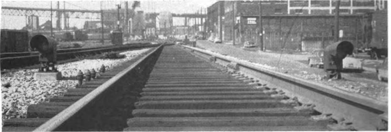
SEARCHLIGHT DWARFS used entirely for interlocking home signals. Looking west, signal R3 (left), R5 (right)